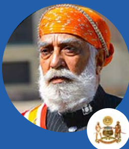
Shriji Arvind Singh Mewar Maharana of Udaipur & Chairman of HRH Group of Hotels