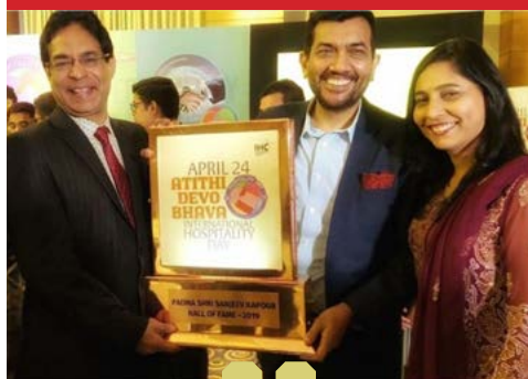
Padma Shri Chef Sanjeev Kapoor - Hall of Fame Honoree 2019

“ This award would have a pride of place not in my office but in my heart.