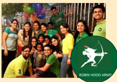
Robin Hood Army, Pune