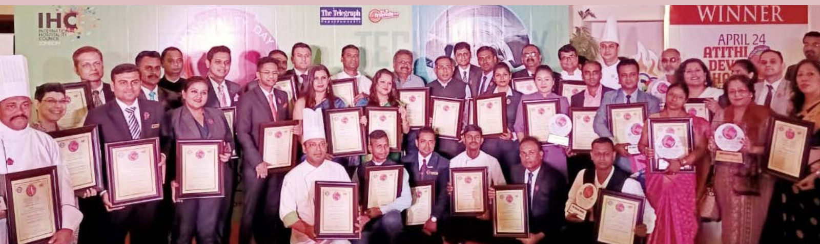
(L to R) Students at IIHM Delhi campus, waiting to register and welcome guests to the International Hospitality Day celebrations on campus; IHD Awards winners at IIHM Hyderabad and the panel discussion on Technology is a Game Changer in the Hospitality Industry

The awardees of the International Hospitality Day Awards posed for a photograph at the IIHM Global Campus, Kolkata on April 24